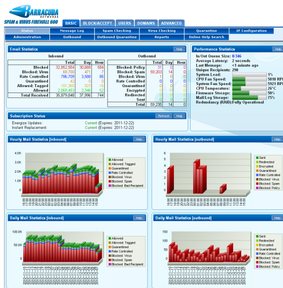
The Barracuda Spam & Virus Firewall filters all email messages and displays the number of emails received with statistics on how they were processed.

The Barracuda Spam & Virus Firewall is easy to set up with no software to install or network modifications required – minimizing ongoing administration. Energize Updates are delivered automatically by Barracuda Central, an advanced technology center where engineers work relentlessly to provide the latest spam definitions, virus definitions, and security updates which are distributed hourly for continuous protection against the latest threats.